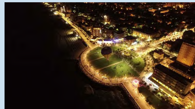
Pesaro - The Night of Wishes - taking place near “Palla di Pomodoro”, a striking contemporary bronze sphere made by Arnaldo Pomodoro.

The sea offers the chance to practice a lot of sports: windsurfing, water skiing, sailing, scuba diving, kite surfing, swimming and beach volley.